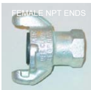
FEMALE NPT ENDS

Also available in brass and 316 Stainless steel