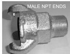
MALE NPT ENDS